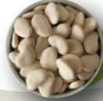
LARGE LIMA BEANS