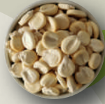
GIANT CUSCO CORN