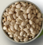
BABY LIMA BEANS